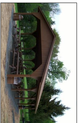
Lake Superior State Park Field Pavilion

Pavilion Capacity: 50 8 Picnic Tables, 1 Grill Washroom w/ vault toilets Hiking Trails, Interpretive Display, Wooded Area