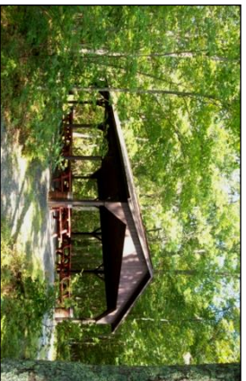
Minisink Battleground Park Pavilion

Pavilion Capacity: 50 8 Picnic Tables, 1 Grill Portable Toilets Fishing, Large Open Field, Shade Trees