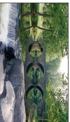
Stone Arch Bridge Historical Park

Non-Pavilion Group Picnic Permit Park Capacity: 200