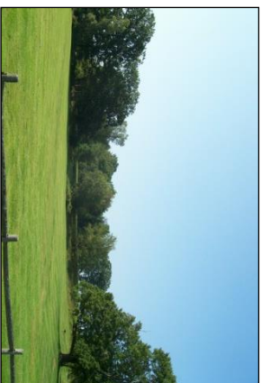
Lake Superior State Park Dam Area

Pavilion Capacity: 75 Per Person Admission Fee Applies* 10 Picnic Tables, 2 Grills Full Service Washroom w/ Showers (seasonal) Vending Machines (seasonal) Guarded Swimming Beach (seasonal), Playground Boat Launch, Boat Rentals, Fishing