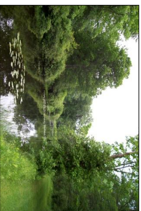
D & H Canal Linear Park

Pavilion Capacity: 50, Park Capacity: 100 8 Picnic Tables, 1 Grill Portable Toilets Historic Covered Bridge, Stream, Fishing