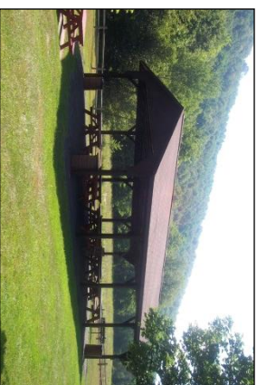
Livingston Manor Covered Bridge Park Pavilion

Non-Pavilion Group Picnic Permit Per Person Admission Fee Applies* Full Service Washroom w/ Showers (seasonal) Portable Toilets, Volleyball Net Vending Machines (seasonal) Guarded Swimming Beach (seasonal), Playground Boat Launch, Boat Rentals, Fishing