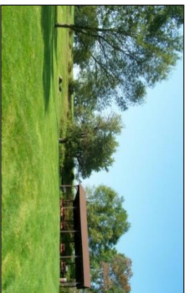
Lake Superior State Park Dam Pavilion

Pavilion Capacity: 75 Per Person Admission Fee Applies* 10 Picnic Tables, 2 Grills Full Service Washroom w/ Showers (seasonal) Portable Toilets, Volleyball Net Vending Machines (seasonal) Guarded Swimming Beach (seasonal) Playground Boat Launch, Boat Rentals, Fishing