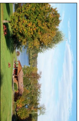
Lake Superior State Park Beach Area

Non-Pavilion Group Picnic Permit Park Capacity: 100 Picnic Tables, Grills & Playground Washroom w/ vault toilets Historic Stone Arch Bridge, Stream, Fishing