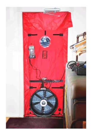
The blower door apparatus

Most energy improvements begin with an examination of current energy systems and building conditions. The resulting energy assessment (sometimes called an energy audit) serves as a "checkup" for homes, commercial buildings and municipal facilities, conducted by a qualified contractor who examines existing conditions and identifies areas where improvements can be made. To qualify for access to NYS financing and incentives to help you improve the energy efficiency of your property, your energy assessment must be conducted by a NYSERDA-approved contractor who is accredited by the Building Performance Institute (BPI).