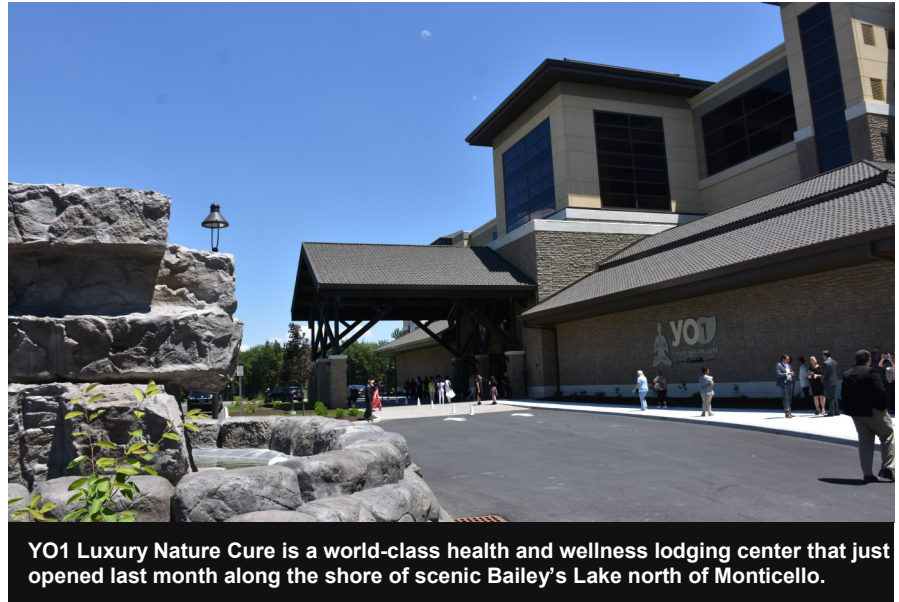
YO1 Luxury Nature Cure is a world-class health and wellness lodging center that just opened last month along the shore of scenic Bailey's Lake north of Monticello.