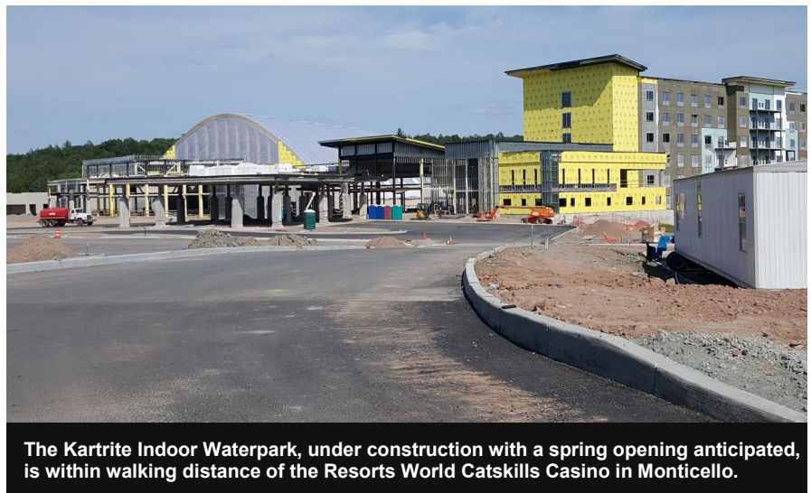
The Kartrite Indoor Waterpark, under construction with a spring opening anticipated, is within walking distance of the Resorts World Catskills Casino in Monticello.