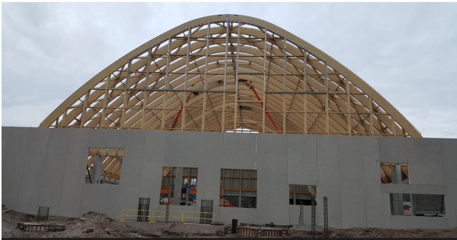
The 85,000-square-foot waterpark's roof is under construction. When complete, it will allow guests to swim year-round, likely requiring sunblock lotion and sunglasses.