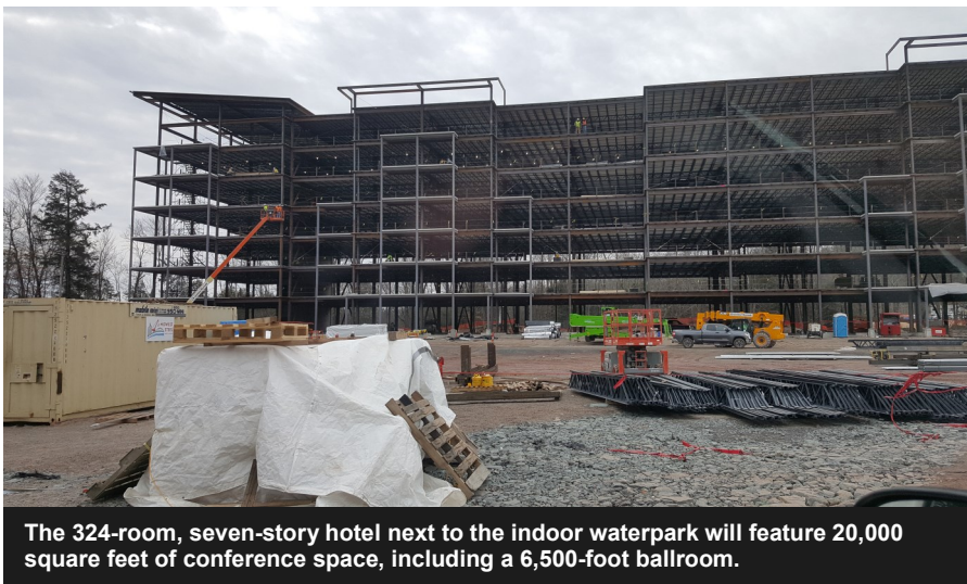
The 324-room, seven-story hotel next to the indoor waterpark will feature 20,000 square feet of conference space, including a 6,500-foot ballroom.

Costing close to $200 million, the resort will cover 425,000 square feet and will likely be a focal point for families looking not just to swim and recreate at the waterpark but to enjoy Legoland, the casino and existing attractions in the Sullivan, Orange and Ulster region.