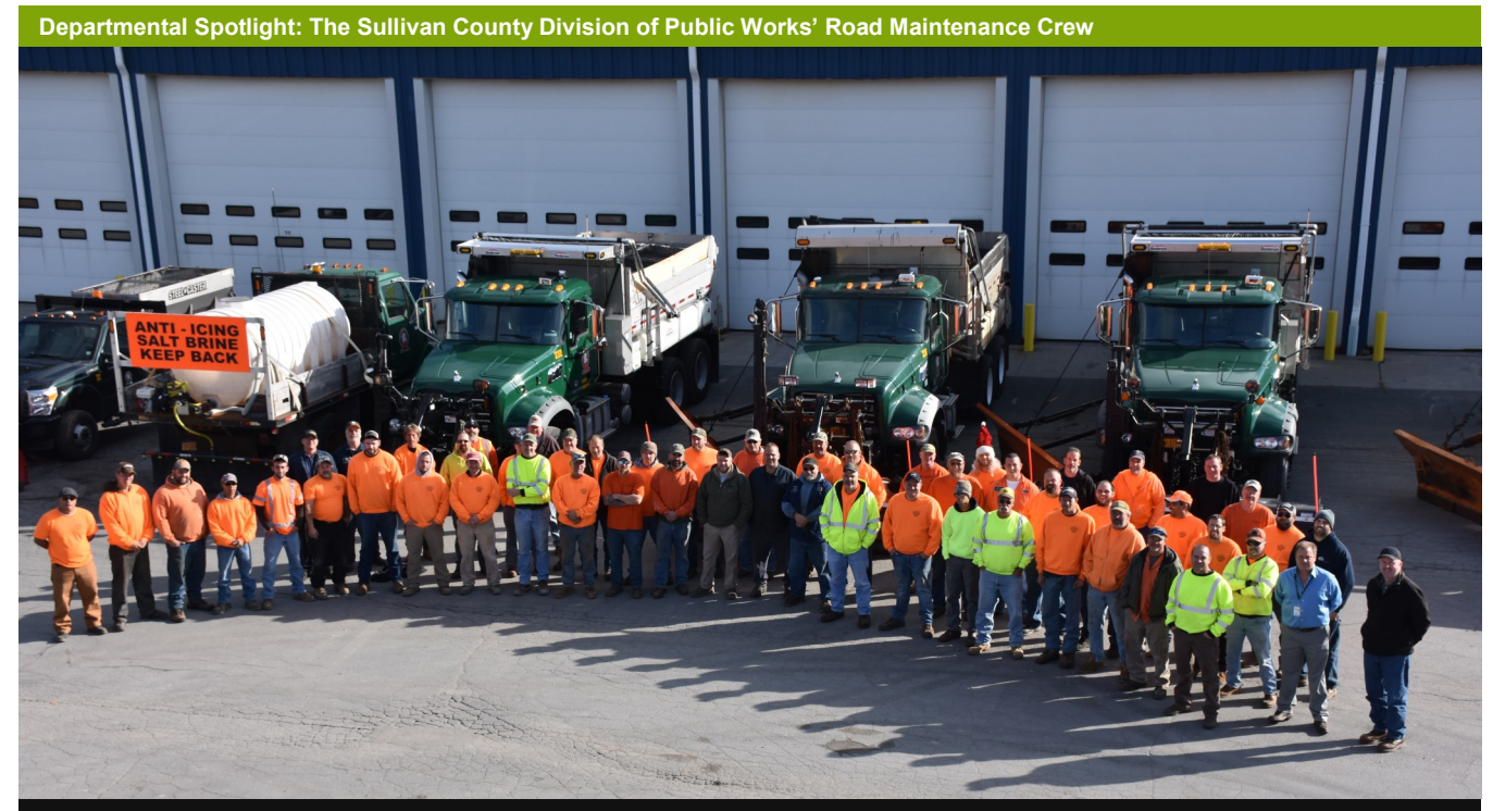
The Road Maintenance crew of Sullivan County's Division of Public Works has spent weeks thoroughly preparing for winter's blast. The hardworking team includes personnel from the Bridge Department, Sign Shop, Mechanics and Welders.