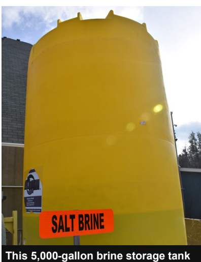
sits above Maplewood.

Several County routes are pre-wet in a different fashion (but at similar cost sav-