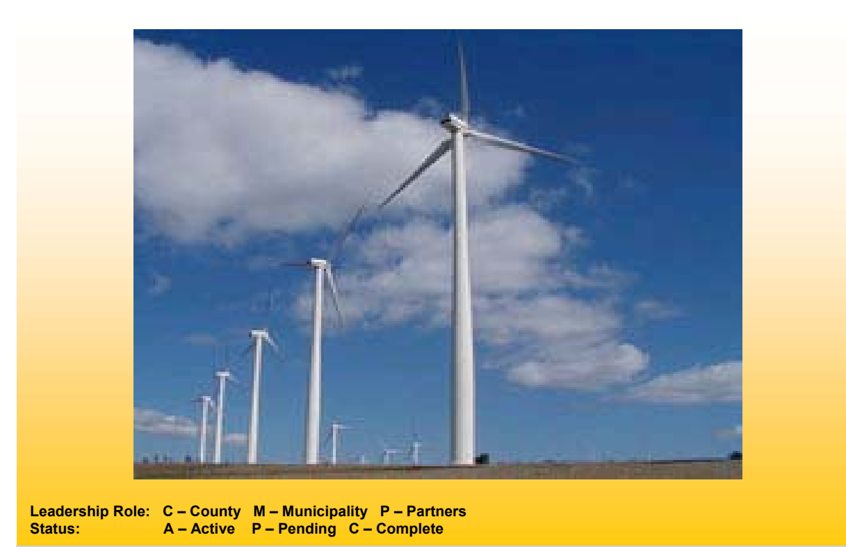
Alternative Energy Sources: Sullivan 2020 Toolbox