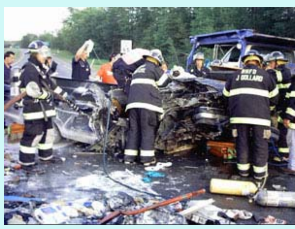
Rock Hill Fire Department