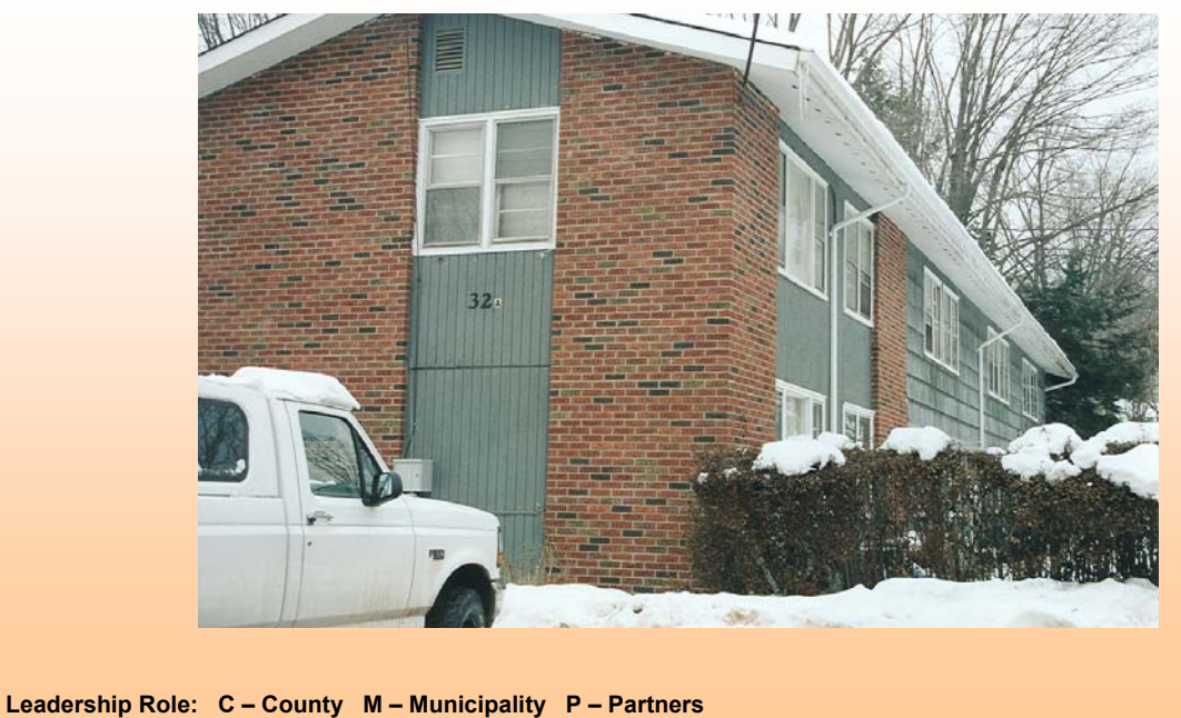
Status: A - Active P - Pending C - Complete